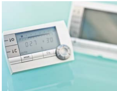
Heating-, ventilation- and air conditioning technology