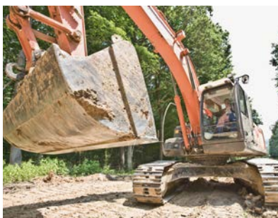
Construction and agricultural machinery