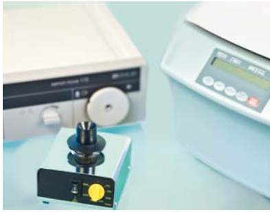
Medical and laboratory technology

MARQUARDT SWITCHES AND SENSORS – FOR A WIDE RANGE OF APPLICATIONS