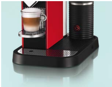
Small household appliances