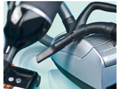
Cleaning & drive applications