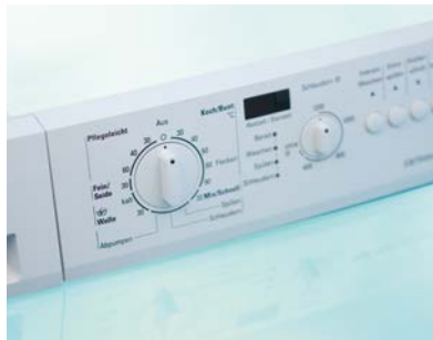
Large household appliances